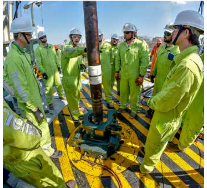
▲ Rig demonstration at Tenaris Rig Direct® Academy in Mexico.

Three runs in trial wells were performed using TenarisHydril Wedge 441™ for the whole production casing string. All three trial runs